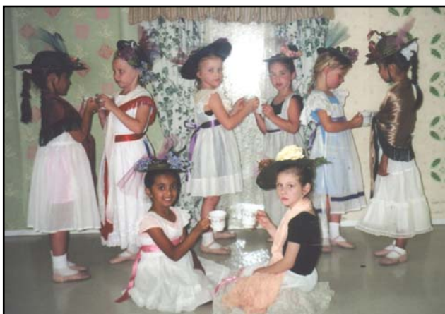
Victorian Fantasy (Childrens' Workshop, Summer 2006)