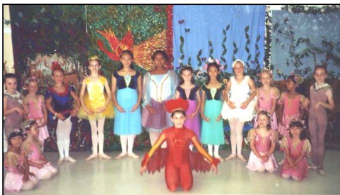
The Firebird (Childrens' Workshop, Summer 2006)