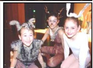
Dances from the Earth Spring 2006